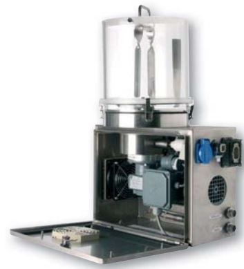
定量加注设备 用于牛油和人造黄油 Dosing unit for butter and margarine