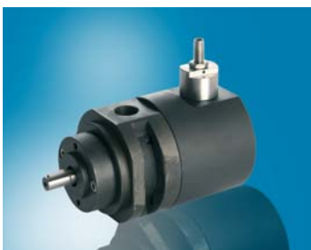
大排量内齿轮泵 集成安全阀 低噪音

High capacity internal gear pump with integral pressure limiting valve for low noise application