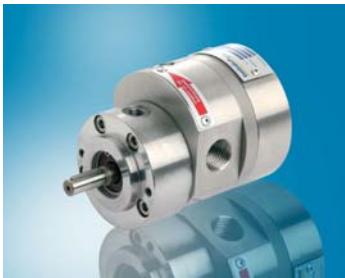
不锈钢齿轮定量泵 特殊设计

Stainless steel gear dosing pump in special design